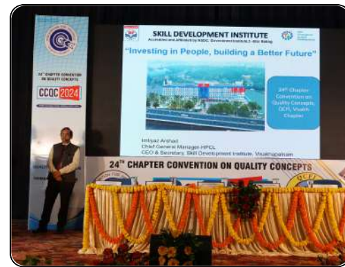
QCFI & CCQC 2024, Meeting