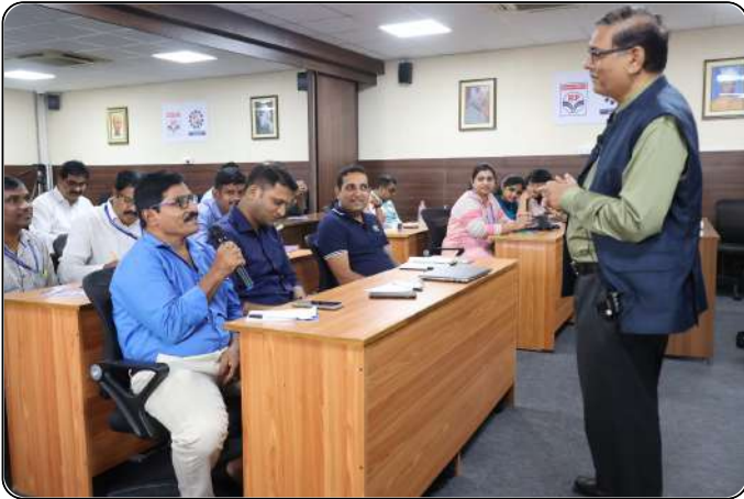
Managerial Development Program