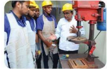
Fitter - Fabrication