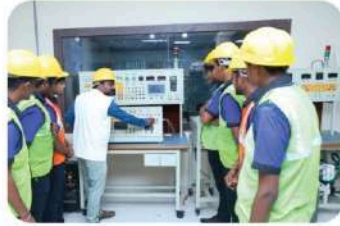
Industrial Electrician (Oil & Gas)