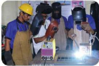
Pipe Fitter - Oil & Gas