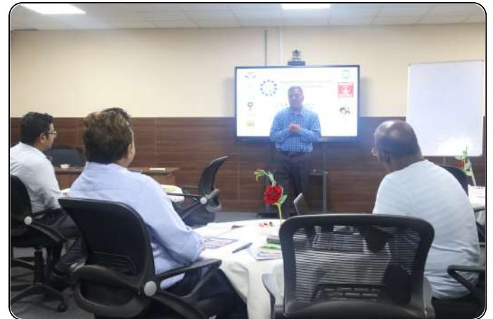
Lean Six Sigma Green Belt Workshop