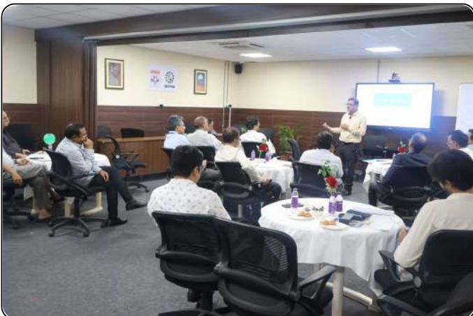
Impactful Director's Program