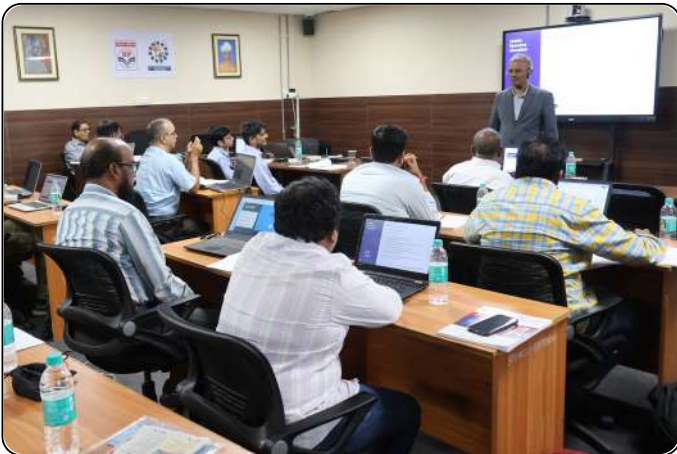
Project Management Workshop