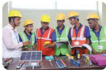
Solar PV Installer