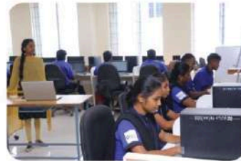
Data Feeder - Warehouse