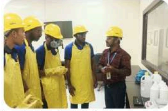
Assistant- Maintenance (Pharma, Biologics)