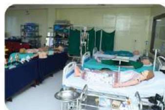
General Duty Assistant