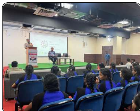
Drugs & Crime Awareness Session