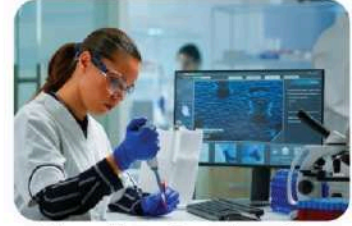
Chemist - Production (Pharma & Biologics)