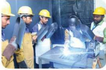
Manual Metal ARC Welding