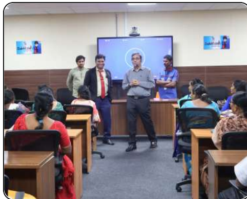
HP Sakhi Program