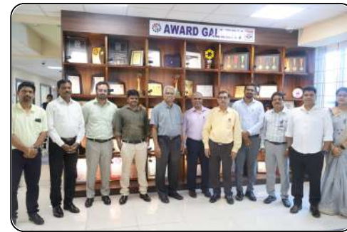
Visit of FIPI Officials