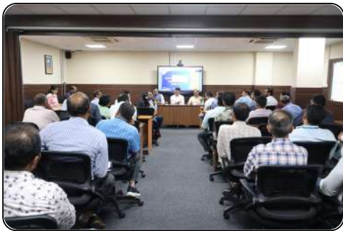
Meet with IT/ITES and DeepTech Naipunya