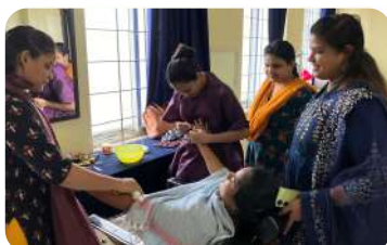
Bridal, fashion & Makeup artist