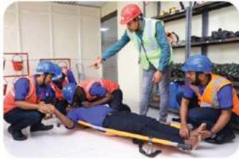
Fire Safety Technician (Oil & Gas)