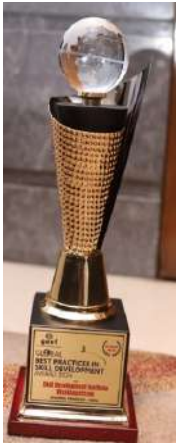
Received a Prestigious Global best practices in Skill Development Award 2024 from GEEF organization on March 20,2024