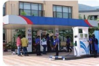
Retail Outlet Attendant