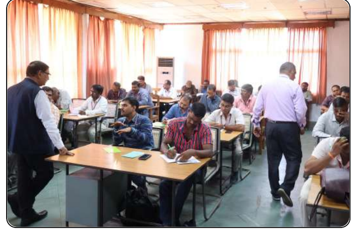
QMS/Lean /5S Training