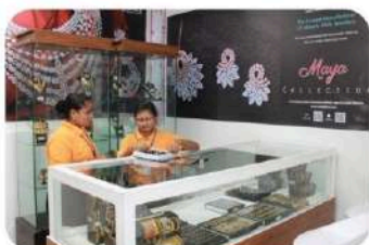
Retail Sales Associate