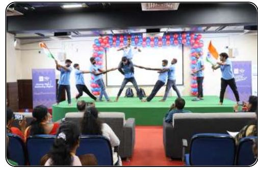
World Youth Skills Day Celebrations