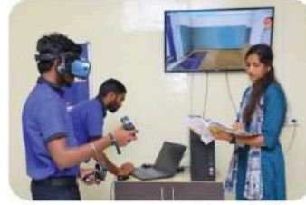
Assistant - Manufacturing and Packaging