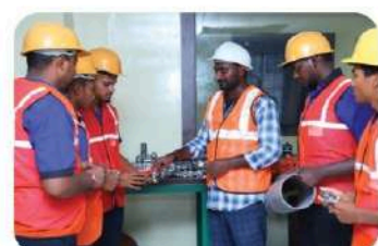
Plumber - General