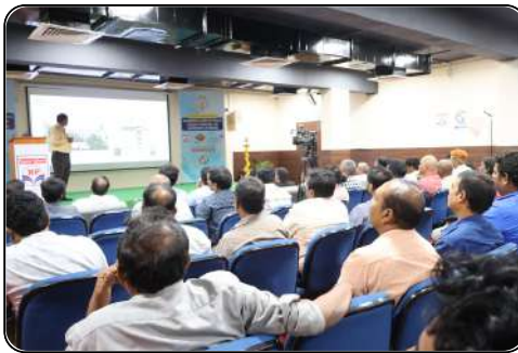
HPCL Boilers Program