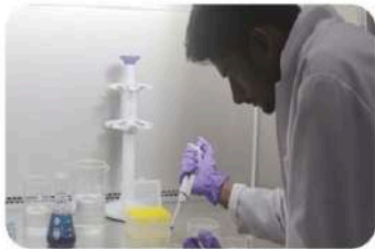
Lab Technician - Research & QC