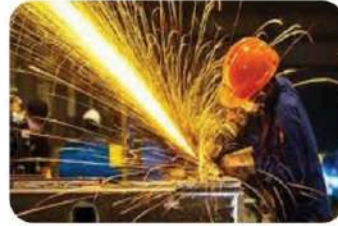
Industrial Welder (Oil & Gas)