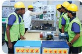
Process Instrument Operator (Oil & Gas)