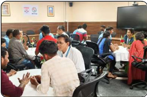
Parent Trainer's Meeting