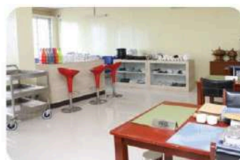
Food & Beverage Service Associate