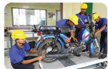
Two Wheeler Service Technician