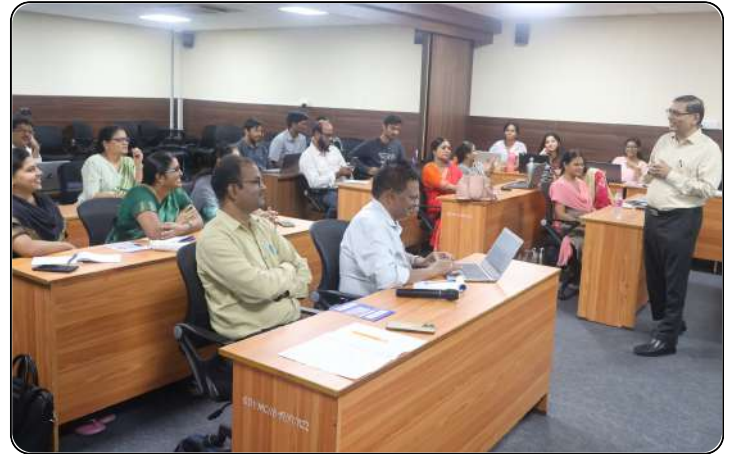
Faculty Development Program