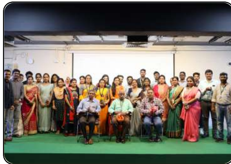
Teacher's day Celebrations